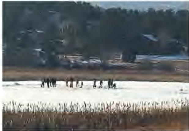
'Twas the day after Christmas or an alternate title, "Build it and they will come": A community hockey game December 26 at Perry Park Ranch's Gateway Pond.

I was inspired to write this article for the Sentinel because I like to be able to step out my door and see the awesome night sky. Apparently other people value that opportunity as well, just as they value the open space, wildlife, trees and rocks that we are blessed with here in Perry Park. I hope that by using outdoor lighting smartly we can preserve our dark night skies and keep some of the urban sky glow well away from our homes.