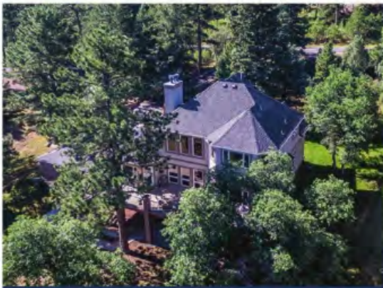
6045 S. PIKE DRIVE | PERRY PARK | OFFERED AT $689,000 | UNDER CONTRACT!