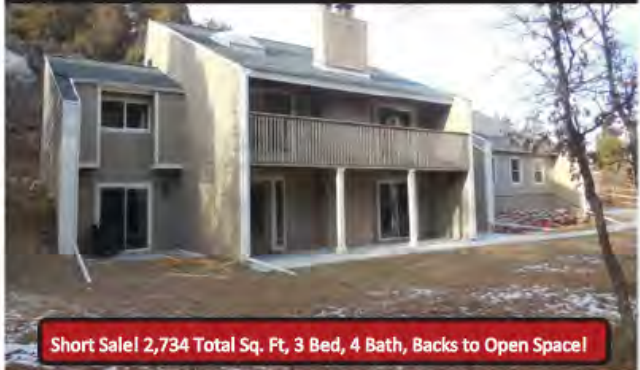
Short Sale! 2,734 Total Sq. Ft, 3 Bed, 4 Bath, Backs to Open Space!

5605 Country Club Drive 699,900 Perry Park