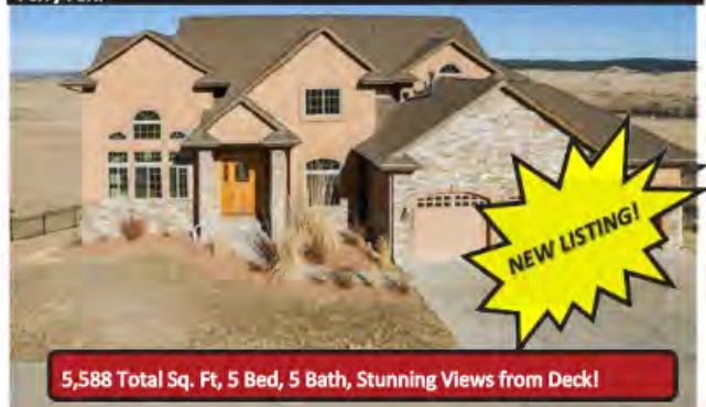
5,588 Total Sq. Ft, 5 Bed, 5 Bath, Stunning Views from Deck!

5605 Country Club Drive 699,900 Perry Park