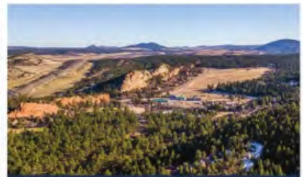
7073 PERRY PARK BLVD. | PERRY PARK | OFFERED AT $79,900