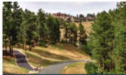
4180 CHEYENNE DRIVE | PERRY PARK | OFFERED AT $115,000