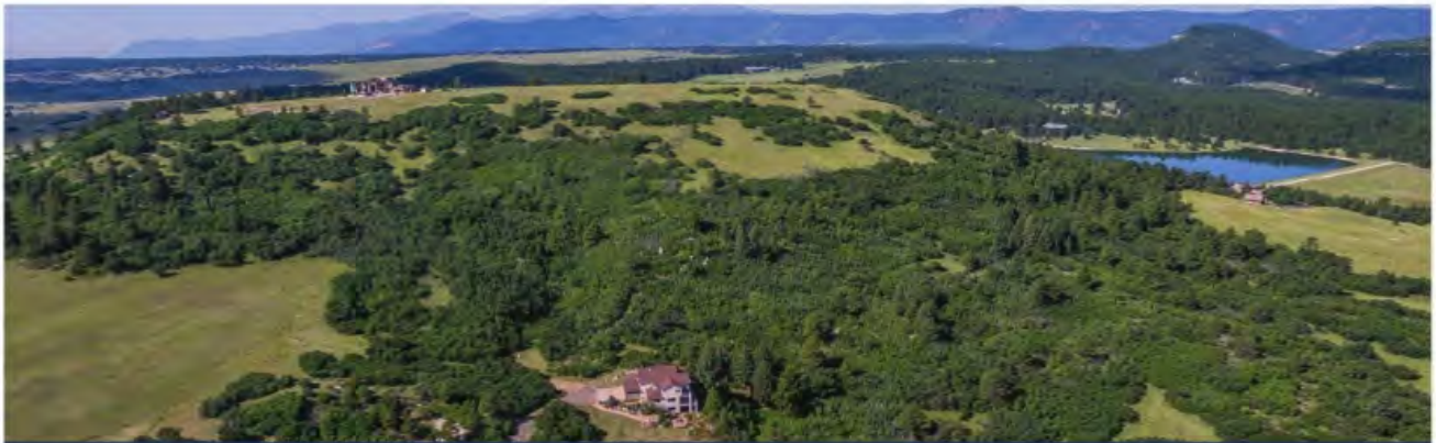
14232 STRAIGHT PATH LANE | THE TIMBERS IN LARKSPUR | OFFERED AT $1,295,000 | HOME ON 36 ACRES WITH ICE SPORTS AND WATERSKI LAKE!

Broker / Owner - RE/MAX Alliance - 7437 Village Square Drive, Suite 105, Castle Pines, CO 80108 720.988.4058 | eowens@remax.net | www.ElizabethOwens.net