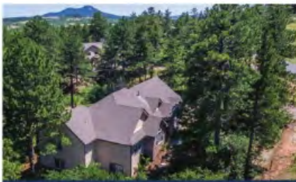
4185 CHEYENNE DRIVE | PERRY PARK | OFFERED AT $675,000