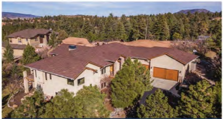
4675 DELAWARE DRIVE | PERRY PARK | OFFERED AT $749,900 | JUST SOLD!