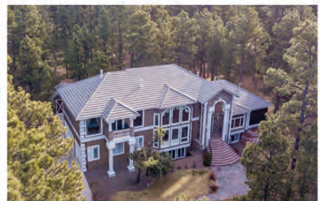
17075 VISCOUNT COURT | BENT TREE | OFFERED AT $1,099,000 | 2.5 ACRES!