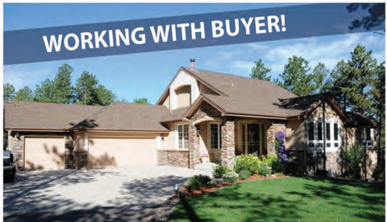
1957 PONCHA COURT | STERLING POINTE | UNDER CONTRACT!