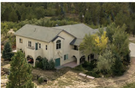
8376 SUGARLOAF ROAD | PERRY PARK EAST | OFFERED AT $899,999 | 5 ACRES!