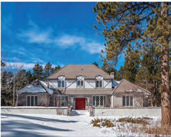
4140 LARKSPUR LANE | ASSEMBLY ESTATES | OFFERED AT $750,000 | JUST LISTED!