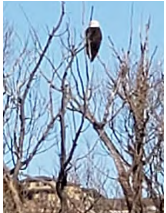
A pair of bald eagles has taken up residence near the west frontage road.

The LFPD Board's next scheduled board meeting is Thursday, March 14, 2019, 7 p.m., at Station 161. The meetings are open to the public.