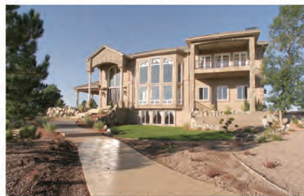
2775 E. HIGHWAY 105 | MONUMENT | OFFERED AT $1,125,000 | 5.22 ACRES!