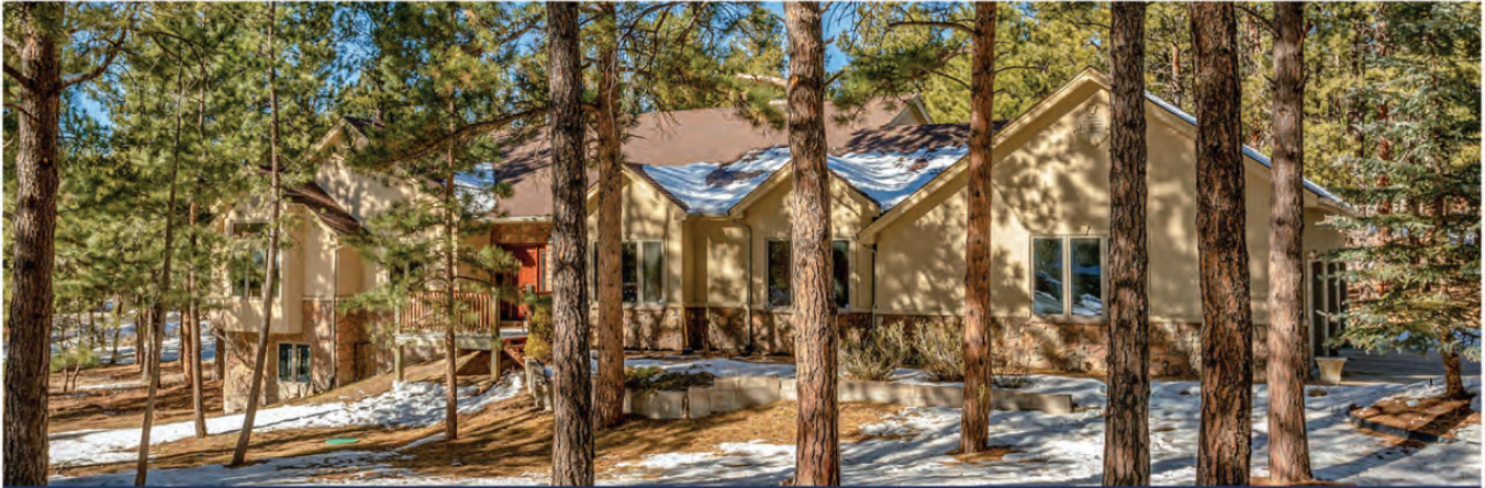
1905 CINNAMON COURT | STERLING POINTE | OFFERED AT $750,000 | JUST LISTED!

Broker / Owner - RE/MAX Alliance - 7437 Village Square Drive, Suite 105, Castle Pines, CO 80108 720.988.4058 | eowens@remax.net | www.ElizabethOwens.net