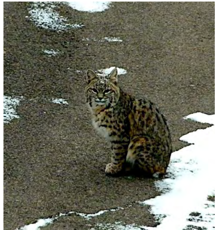
BOBCATS ABOUND: This one posed nicely against a complementary background that shows off the very distinct markings.

Many of the amenities will need community donations to survive.